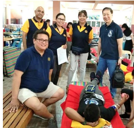
Joint Bloodletting project with RC Davao, RC Davao 2000, RC North , RC Central, RC Downtown & RC Matina in partnership with Stella Maris Academy PTA. Sept. 8, 2019 at Stella Maris Academy